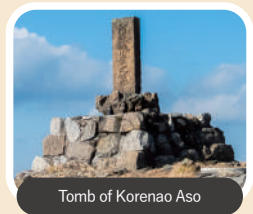
Tomb of Korenao Aso