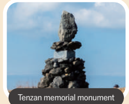
Tenzan memorial monument

Experience this Saga travel route which connects local attractions about history, culture, hot springs, food, and more. Be a part of the new "OPEN-AIR Saga" lifestyle and enjoy various outdoor activities amongst Saga's beautiful scenery.